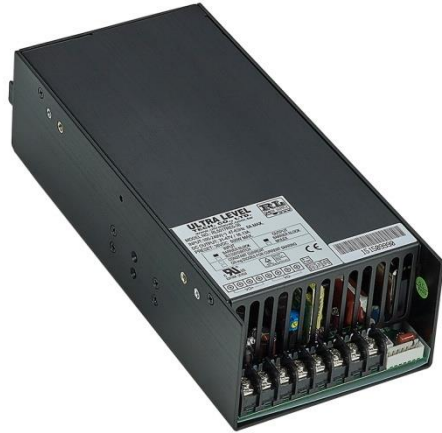
Enclosed with built-in fan Type: 9.2(L) x 4.3(W) x 2.5(H) inches.